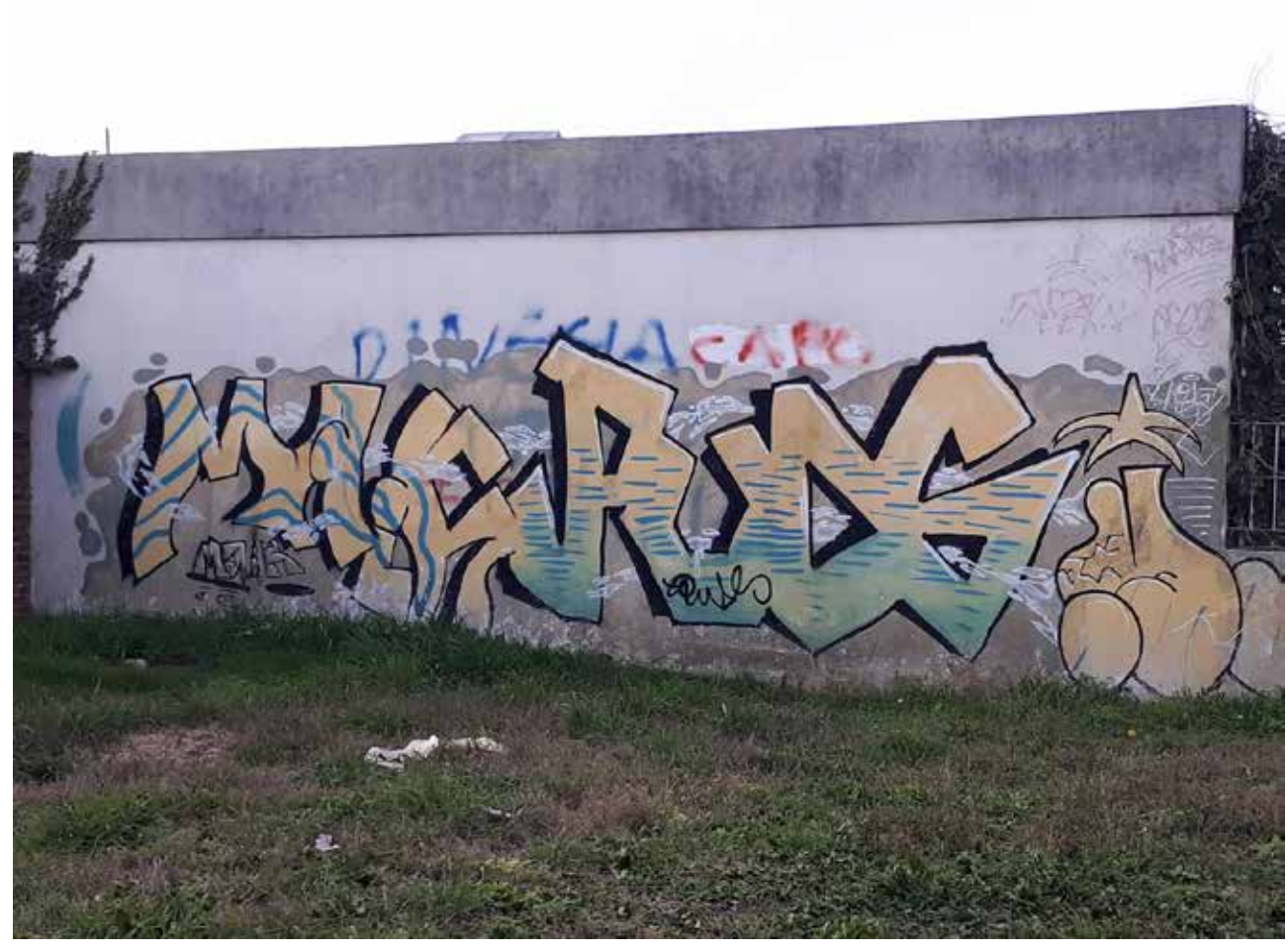
Fig. 7 - Style writing. Piece and tags (La Plata, 2018).

Although the quotes of clever inscription graffiti have reached such a level of popularity that they ended up building an autochthonous model of Argentine graffiti, there are intimate or introspective signatures and messages that contrast with gang and soccer graffiti (Ferraresi and Randrup, 2009). That is the case of 'tumbero' graffiti ('tumbero' is slang for delinquent), which coexists in different neighborhoods and whose presence is a trace of marginality.