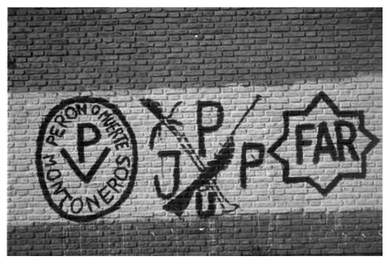
Fig.3 – Historical Pintadas [political graffiti] from the Resistencia Peronista, circa 1974.

signs are all native, local traditions in Argentina, which have been labeled by the people who produce them: pintadas , afiches , murales . This terms are deeply rooted in our political traditions and are still used in the present.