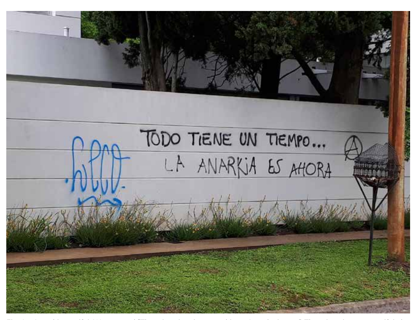
Fig. 4 – Anarchist graffiti. We can read "There is a time for everything... Anarchy is now". There is a signature graffiti also [LECO] (La Plata, 2019).

Following is an example of political graffiti which we do not consider a "pintada". In this case, we can see the positioning the author is making about their (political) view, but they are not linking their statement to a political party per se , nor are they using a political party signature.