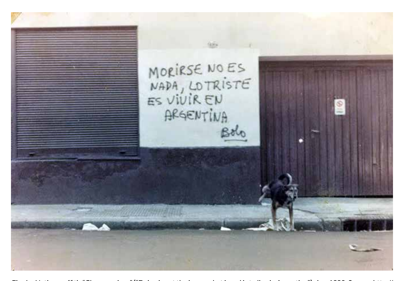
Fig. 6 – Native graffiti. "Clever sayings" ["Dying is not the issue; what is sad is to live in Argentina"] circa 1980.

It should be noted that signature graffiti was also practiced in our territory, although it did not display stylistic issues or generate competitive games like it did in North American graffiti of the time. This activity was deemed to take place outside of political communication, which is why it was referred to as graffiti, reserving the term "pintada" for partisan mural writing (Kozak, 2009), and it was associated with the use of spray paint. This was confusing given that many political slogans were done in spray paint and anonymously (Rodríguez, 2017). The difference is, overall, semantic and sometimes its limits are very much blurred. Again, this is another important reason why local, native forms of graffiti and pintadas, murales and posters, should be carefully identified, documented, studied and interpreted. Given the relevance of all these different practices, the term graffiti possibly emerged in a time of academic interest on the subject-matter, trying to establish an overall concept