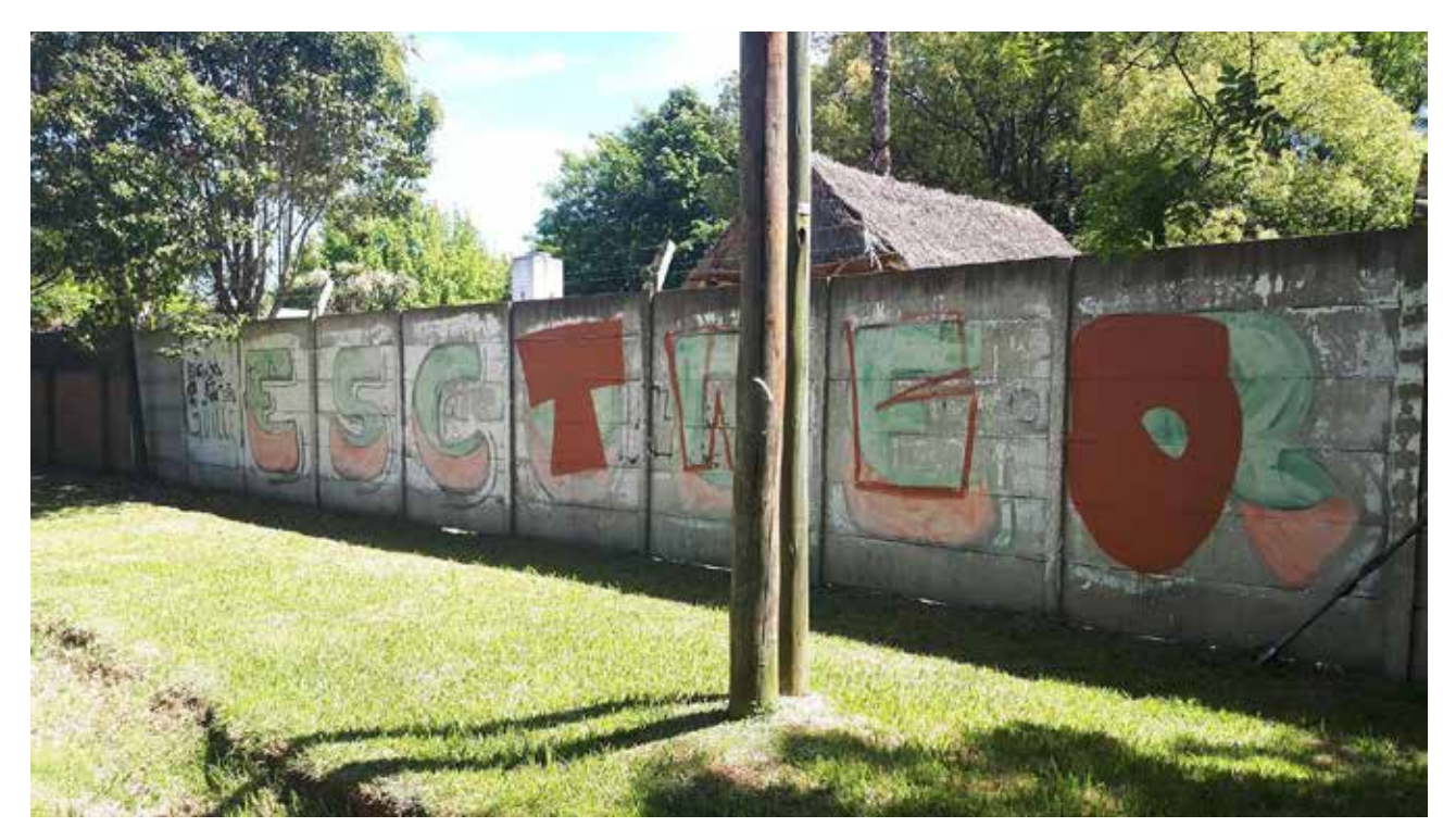
Fig.4 – Contemporary political Pintada . Candidate's name in big letters, with the TWC Crew tag [a local crew] painted over. We can read "Guille ESCUDERO" candidate for City Major (La Plata, 2020).