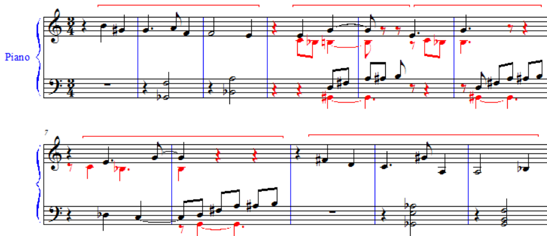
Figure 1. Excerpt (measures 1-11) of the Schoenberg's piano piece Op. 11, no. 1 used in the present study.