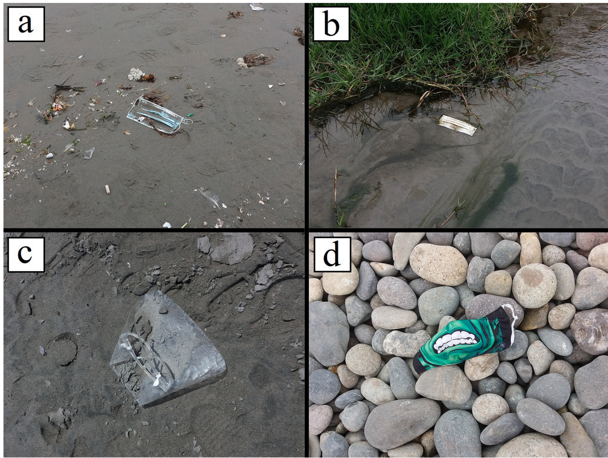
Fig. 2. Photographs of COVID-19 PPEs found in coastal areas of Lima, Peru. a) A face mask on the strandline in a sandy beach, b) a facemask in a water stream, c) a face shield discarded in a sandy beach, and d) a face mask discarded in a rocky beach.

Moreover, weathering conditions promote plastic items to leach toxic additives, like flame retardants and polychlorinated biphenyls (PCBs) (Bejgarn et al., 2015; De-la-Torre et al., 2020; Teuten et al., 2009). The effectiveness of the chemical sorption or release will vary depending on environmental factors and the physical-chemical characteristics of the plastic items.