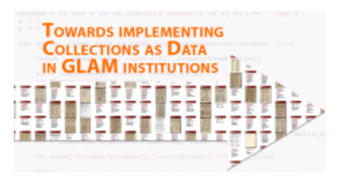
Fig 1. Webinar presented in collaboration with the International GLAM Labs Community.<sup>1 1</sup> https://glamlabs.io/events/collections-data/

GLAM institutions are exploring new ways to show researchers how to reuse the content of their digital collections. In addition to the dedicated websites, Labs, data repositories and documentation (e.g., README files), Jupyter Notebooks have emerged as a powerful tool to provide documentation and code that can be run in cloud environments without the need to install additional software.<sup>2</sup>In this sense, we have designed a framework to extract digital collections as Collections as data that include the use of Jupyter Notebooks and has been applied to a wide diversity of digital collections made available by GLAM institutions [6].