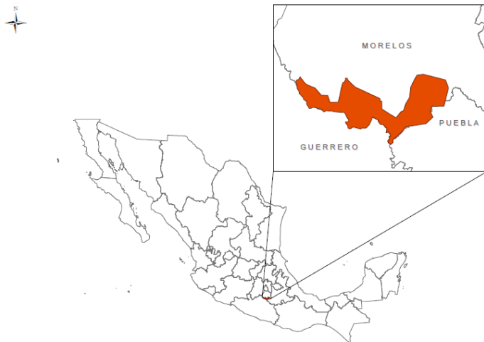
Figure 1. Location of the Sierra de Huautla. Elaboration based on CONANP (2006).

The Rebiosh is located in the southern part of the state of Morelos, Mexico, to the south it borders the states of Guerrero and Puebla (Figure 1). By 2007, 31 communities, with 23 544 inhabitants, had their territory or part of it included within the borders of the Rebiosh (INEGI, 2006). The municipalities and localities are: Amacuzac, Casahuatlan and Rancho Nuevo (municipality of Amacuzac); El vergel (municipality of Ayala); Chisco and Vicente Aranda (municipality of Jojutla); La Tigra, El Zapote, Tilzapotla, El Mango, El Salto and Los Tanques (municipality of Puente de Ixtla); Ixtlilco El Chico, Ixtlilco El Grande, El Limon, Los Sauces and Pitzotlan (municipality of Tepalcingo); Ajuchitlan, Santiopa, Chimalactlan, Coaxitlan, Huautla, Huaxtla, Huisaxtla, Nexpa, Xicatlacotla, Pueblo Viejo, Quilamula, Rancho Viejo, San Jose de Pala and Xochipala (municipality of Tlaquiltenango) (CONANP, 2006).