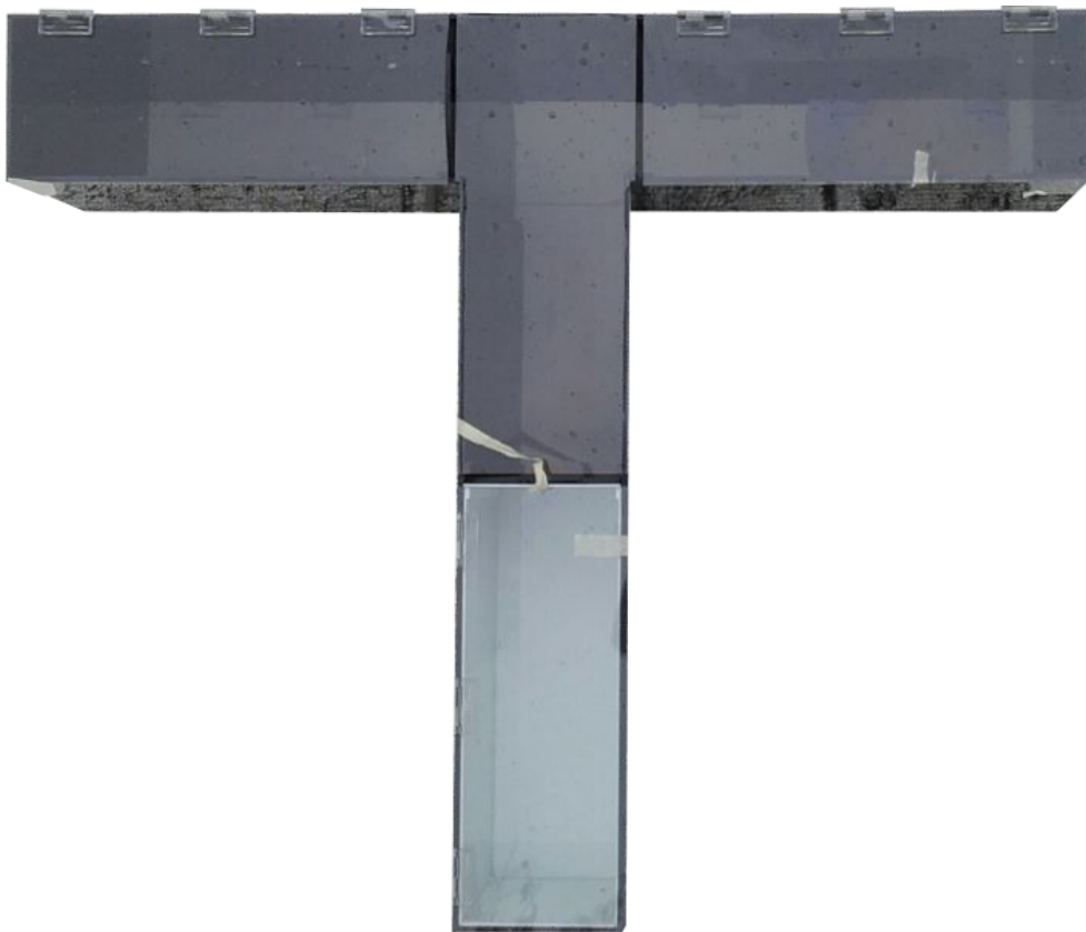
Figure 1. T maze apparatus. Four T mazes were used to measure spatial memory, they were made of black and white acrylic, and they had four parts: the start white alley (36x13.5x17 cm), the black main corridor (39x13.5x17 cm) and two black arms (novel and other) which were perpendicular to the corridor (39x13.5x17 cm). The start alley and main corridor were separated by a guillotine door.

group exposed to the classical activating piece of music (Clas/Act), animals exposed to the relaxing classical musical piece (Clas/Rel), the group exposed to the rock activating piece of music (Rock/Act) and the rats that were exposed to the rock piece with relaxing properties (Rock/Rel). Immediately after, they were transported to the room where the behavioral procedure took place, where two trials (acquisition and test) were administered. The behavior in the apparatuses was videotaped for later scoring by 2 experimenters who were blind to the conditions of the subjects.